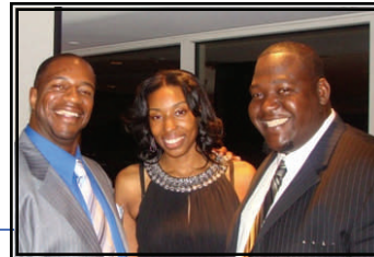
Gala guests, see p. 2